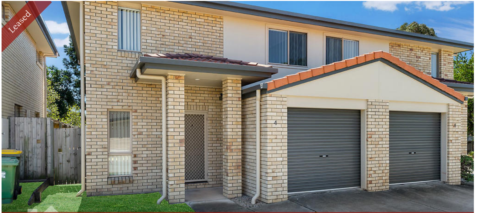
Unit 4, 17 Cunningham St, Deception Bay